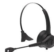
Wired and Wireless