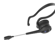
Behind the Neck